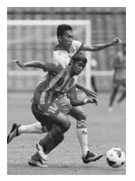
Duo shine for Kelantan