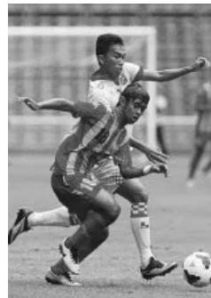
Duo shine for Kelantan