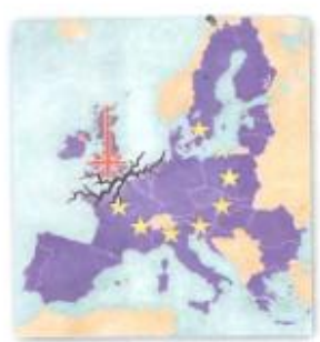
• p10 EU referendum: a Brexit for champions?