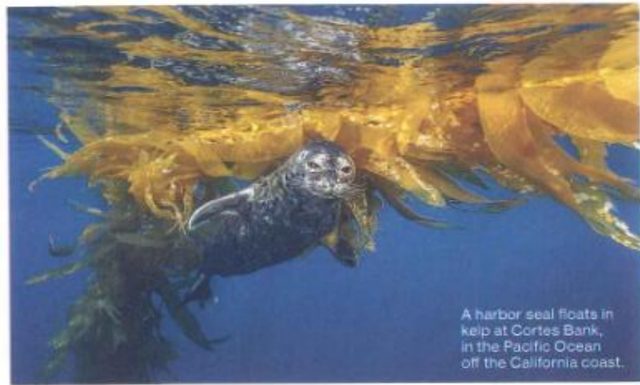
A harbor seal floats in kelp at Cortes Bank, in the Pacific Ocean off the California coast.