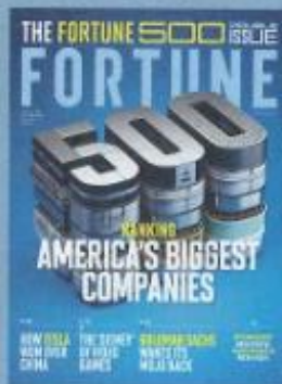
▲ COVER ILLUSTRATION BY FORGE & MORROW