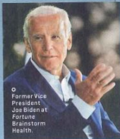
Former Vice President Joe Biden at Fortune Brainstorm Health.