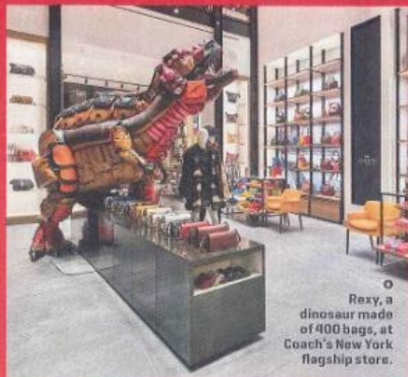
○ Rexy, a dinosaur made of 400 bags, at Coach's New York flagship store.