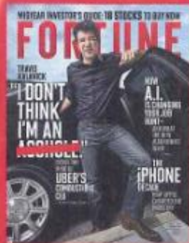
▲ ON THE COVER: TRAVIS KALANICK IN 2015.