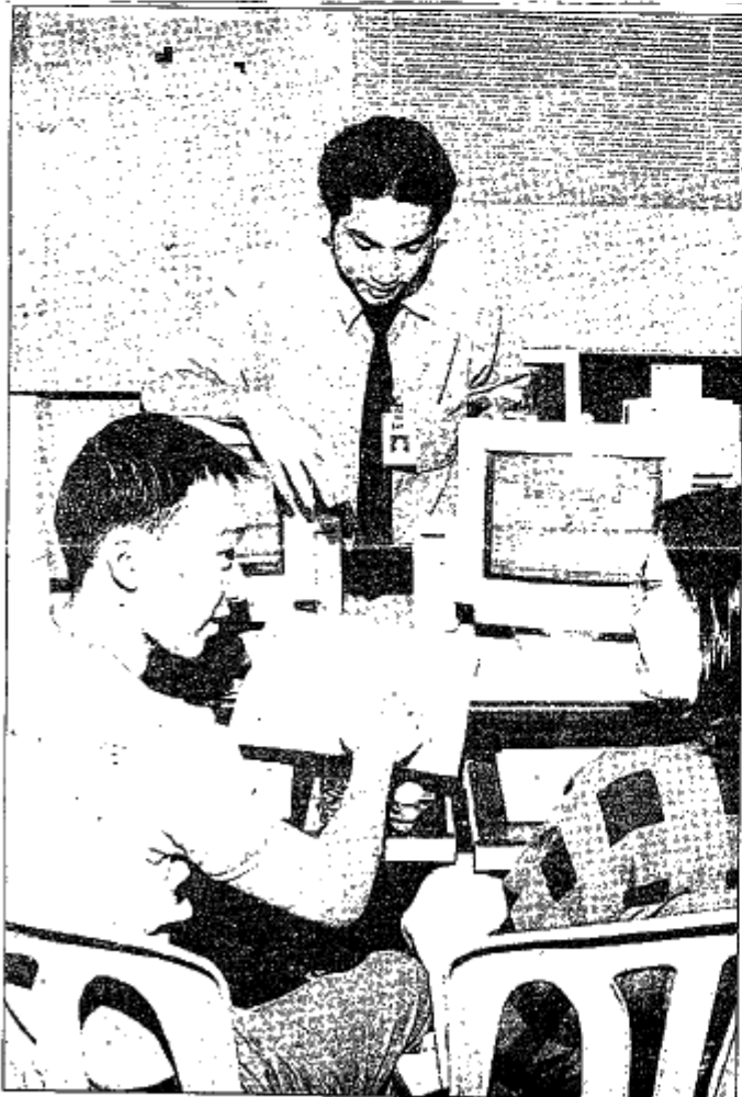
Inti has well-equipped and up-to-date computer laboratories.