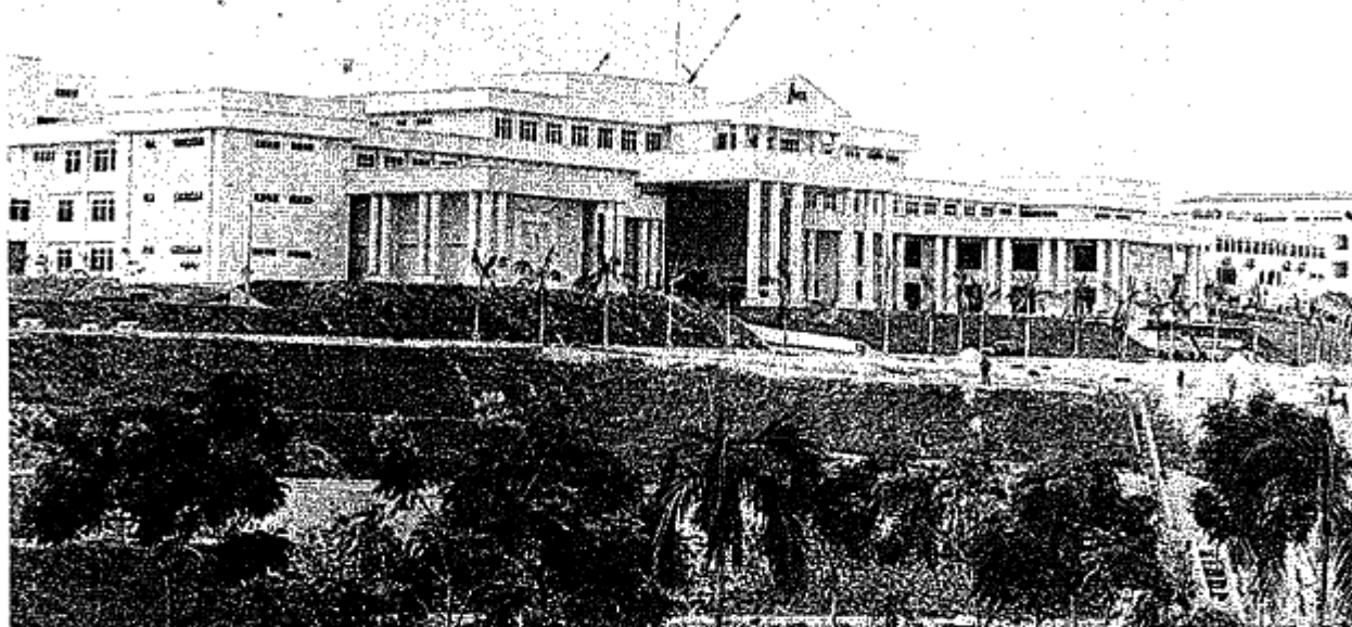
IMPRESSIVE ... The entrance to Inti College's RM100m campus.