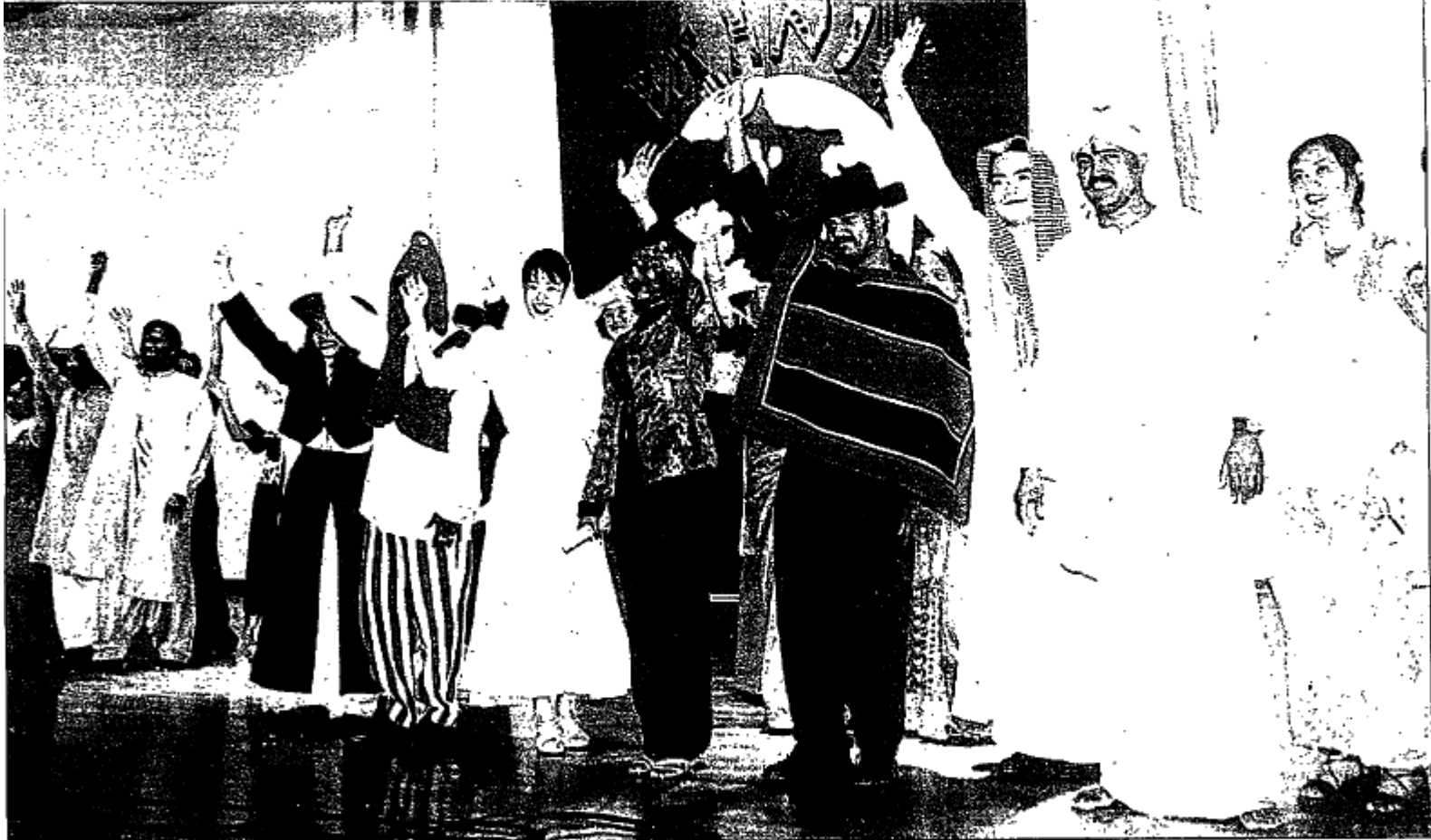
ETHNIC NIGHT ... students in various cultural costumes.