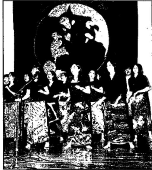
LOVELY LASSES ... these Indonesians presented a medley of five songs.

Guests were also given a brief demonstration on