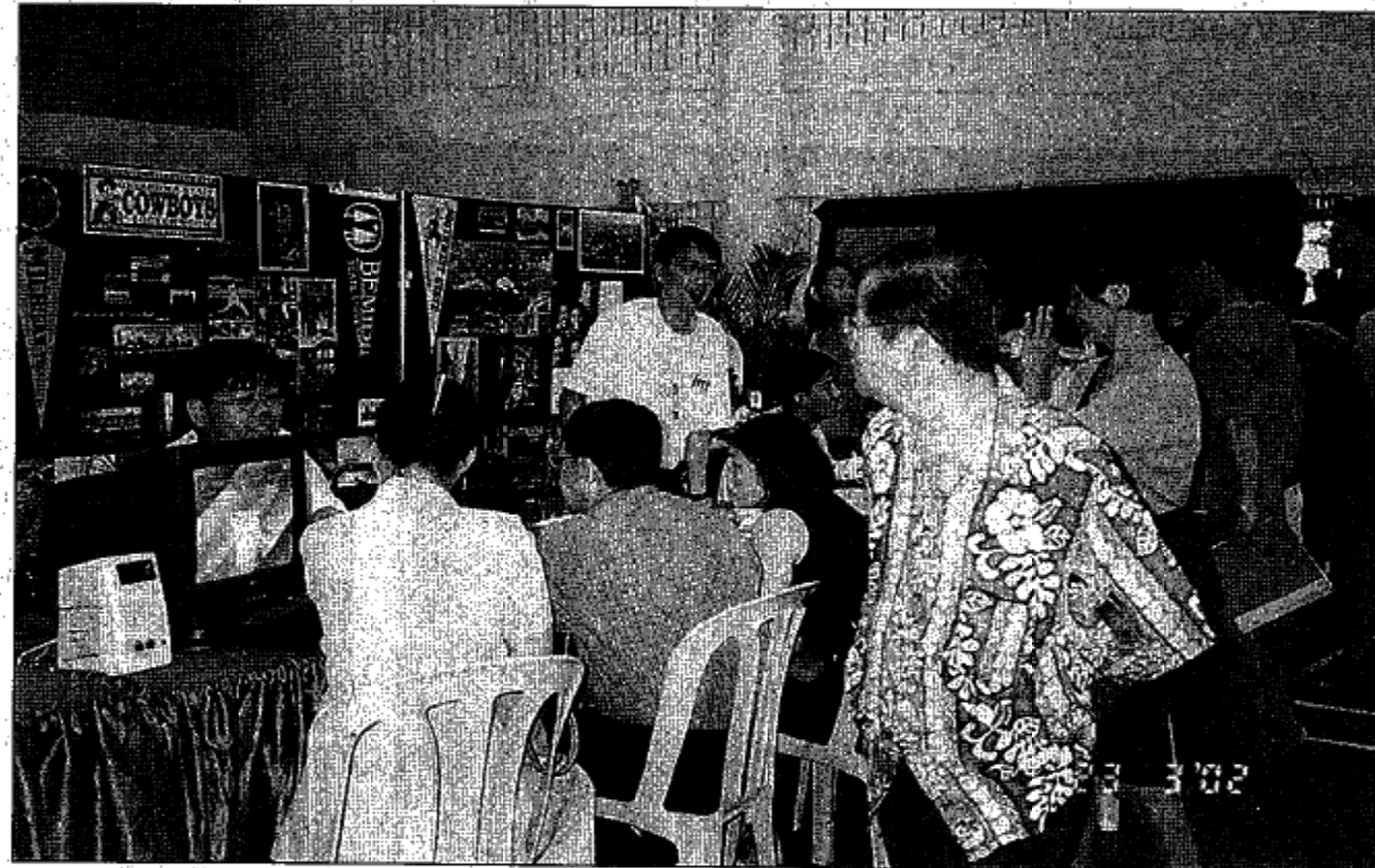
PLENTY TO LEARN ABOUT ... The INTI booths had gifts and informational material for visitors

Since then, it has been sending thousands of young Malaysians to