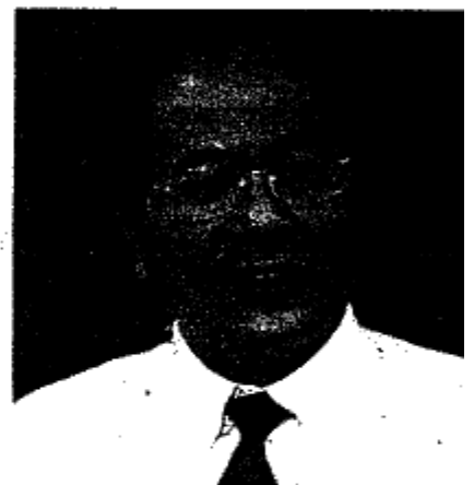
TAN: 'Top marks go to teams for creativity and innovativeness.'

from the Epsilon team is viable as existing technology can support it.